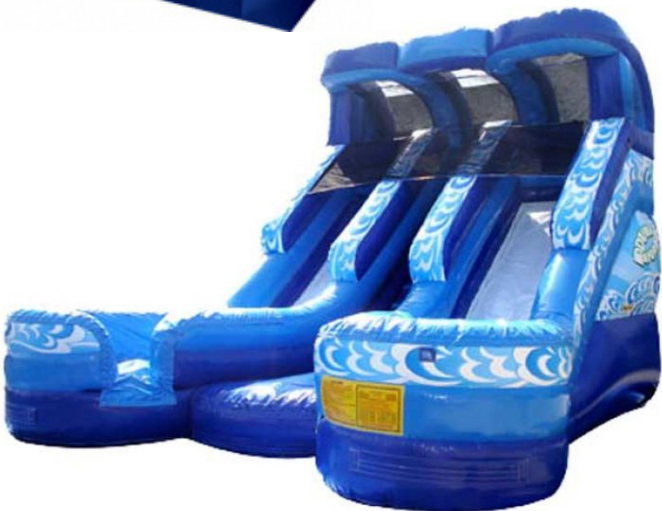
18.5FT DOUBLE LANE SPLASH SLIDE