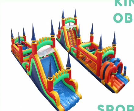
KING'S CHALLENGE OBSTACLE COURSE