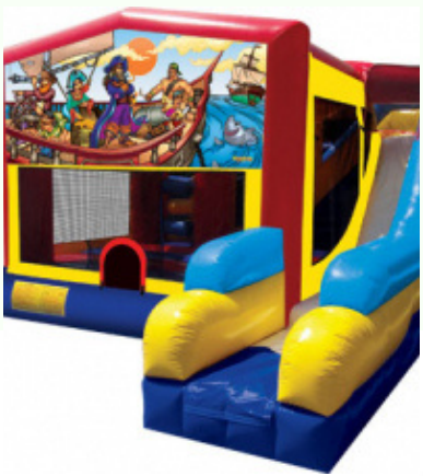
CHILDREN'S BOUNCE HOUSE, OBSTACLE COURSE & SLIDE

FRIDAYS 5PM-9PM SATURDAYS 10AM-6PM EXTENDED HOURS ON LONG WEEKENDS*