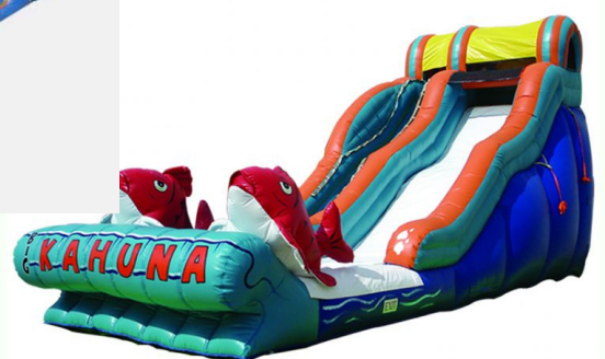
17FT BIG KUHUNA WATER SLIDE